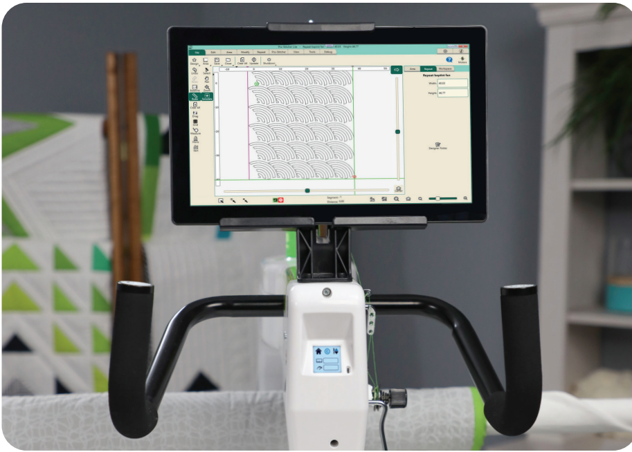
Pro-Stitcher Lite shown on one of many compatible machines.